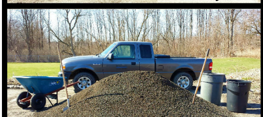
This visual example of biosolids can help you decide how much you will need for your landscape project.