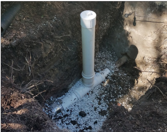
Example of a cleanout being installed.

If you are having any issues with your sanitary service or have to maintain it by frequently rodding, you may be eligible for a repair under the Building Sanitary Service Repair Assistance Program. The Program covers the entire building sanitary service from the building to the public sewer. To qualify for an initial investigation, property owners should submit a Program Application and a sewer rodding or televising invoice that occurred within the previous 12 months. The District will determine if the cause of repeated maintenance activity is a problem eligible for participation and, if so, the appropriate corrective measures. Most often this includes the installation of an outside cleanout access to help more effectively maintain your service. This Program is not a substitute for and does not cover routine maintenance of the building sanitary service such as periodic rodding. This Program also does not transfer ownership of the building sanitary service to the District.