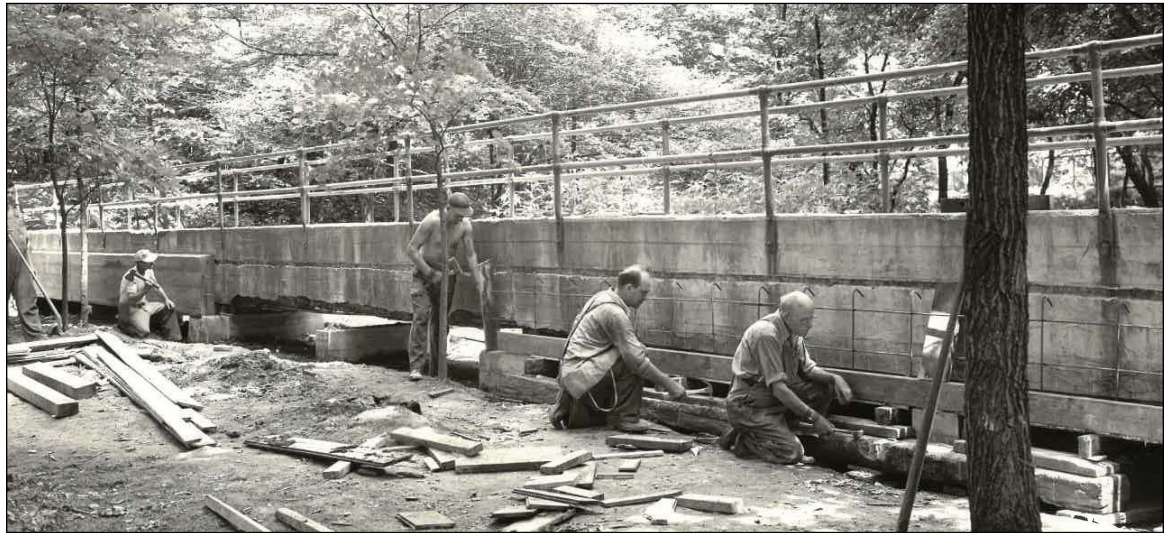
Historical photo of Maple Grove bridge being repaired.