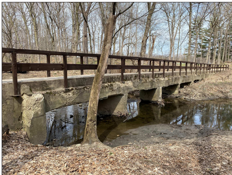
Photo of the bridge in its current state, courtesy of the Forest Preserve District of DuPage County.

A feasibility study completed in 2024 recommended a new 14-foot-wide, 75-foot-long single-span press-brake-formed tub girder bridge, selected for its durability and constructability. Design is currently underway, with construction tentatively expected to begin in 2027.