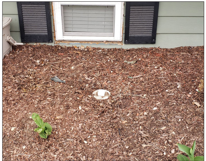
Example of finished installation.