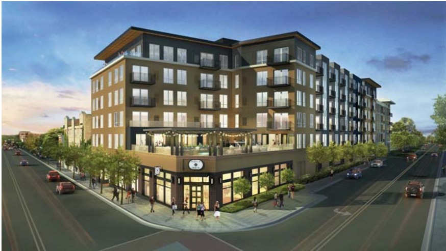
*RENDERING FOR ILLUSTRATIVE PURPOSES ONLY. DO NOT USE FOR BIDDING

1010 Maple Avenue Downers Grove, IL 60515